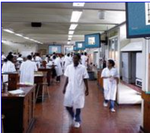
Students doing experimental work in the Undergraduate Lab

It should be noted that a pass in 6-credits of Introductory level Mathematics is required for entry to Advanced Chemistry courses. Passes in both units of CAPE Mathematics (or equivalent) are required for admission to the Introductory Mathematics courses, or alternatively, a pass in Preliminary Mathematics at UWI.