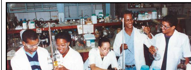
Advanced students engaged in interesting laboratory work

Some of our courses are supported by field trips to industry, to high-tech analytical facilities and even to water treatment and power generation facilities. Our industrial chemistry students learn to operate pilot-scale industrial equipment and study the chemical engineering principles on which they are based. Similarly, our food chemistry students may learn how to make smoked chicken or a variety of canned foods, jams or preserves. Students taking our Undergraduate Research course may get to isolate new medicinal compounds or to make materials with very interesting properties.