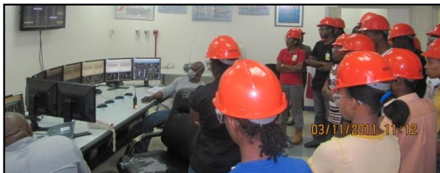
Advanced students learn process control on an industrial visit

Join us in Chemistry at UWI, Mona. Reach towards your goal and make your vision a reality.