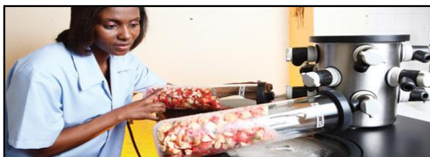
A lecturer conducting research on a Food Chemistry project

Graduates may also pursue research-based studies in areas such as Catalysis, Theoretical Chemistry, Natural Products Chemistry, Organic Synthesis, Food Chemistry, Bayer Process Chemistry, Materials Chemistry, Computational Chemistry or Chemical Education among others. These courses lead to M.Phil or Ph.D. degrees.